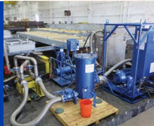
High Velocity Oil Flush of cooler bundles at a manufacturer's plant in Houston, Texas

Oil Filtration Systems® Provides Results.