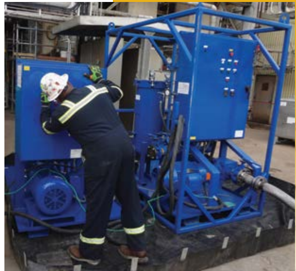
High Velocity Oil Flush of a compressor during a petrochemical plant turnaround on the Gulf Coast