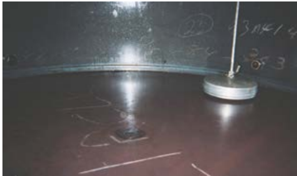
Confined space entry reservoir after cleaning