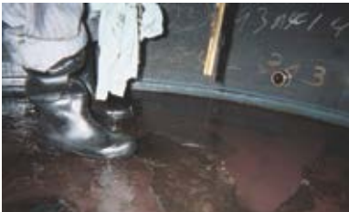
Confined space entry reservoir before cleaning

All of the OFS Field Service Technicians are trained and certified for Confined Space Entry, and we regularly perform internal Tank Clean-Outs on both lube oil and fuel reservoirs. Wiping down the inside of the reservoir with lint-free rags to ensure optimal cleanliness is an important part of most stringent OEM flush procedures.