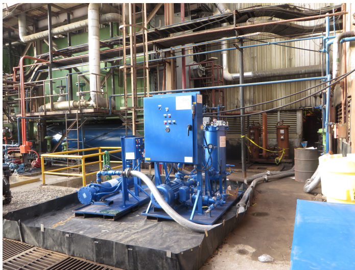
High Velocity Oil Flushing Equipment on Turbine Lube Oil System

Hard varnish deposits often plate out on the metal surfaces of gas turbines, compressors, and other lube oil and hydraulic systems, adversely affecting the operation and performance of the equipment. Using a specialized flush procedure and cleaning agent, hard varnish deposits can be effectively removed from the piping, reservoirs, and other metal surfaces (i.e. servo valves, pressure control valves, etc.), thereby improving the system’s performance and reliability.