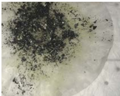
Cooler Bundle Flush – Initial Inspection Screen (Before Flush)