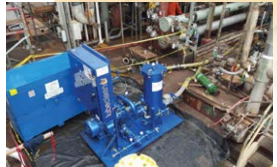
Varnish Removal Flush at a petrochemical plant in Trinidad