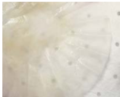
Cooler Bundle Flush – Final Inspection Screen (After Flush)