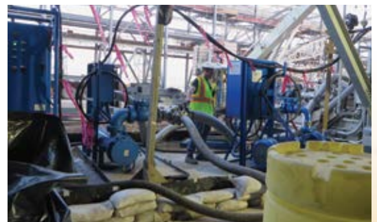
Compressor Lube Oil System commissioning High Velocity Oil Flush at a LNG plant in Louisiana