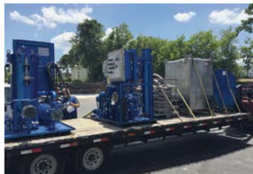
Mobilizing to perform a High Velocity Oil Flush at a power plant in Oklahoma