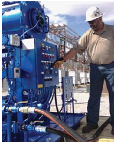
Oil Purification Service at a power plant in Florida