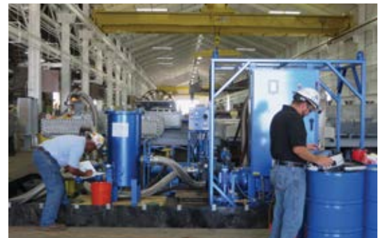
High Velocity Oil Flush of cooler bundles at a manufacturer's plant in Texas