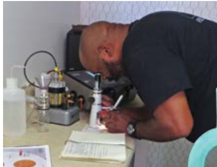
On site oil analysis at a power plant in Mexico

Our highly qualified and experienced Field Service Technicians analyze oil samples onsite using a Portable Fluid Analysis Kit and Laser Particle Counter to accurately determine the ISO/NAS cleanliness level and amount of water contamination in the oil.