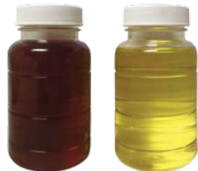
Before Filtration ISO 22/21/19 MPC* Value = 38