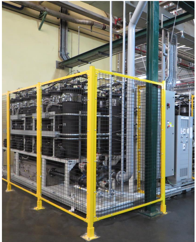
Skid Mount Option